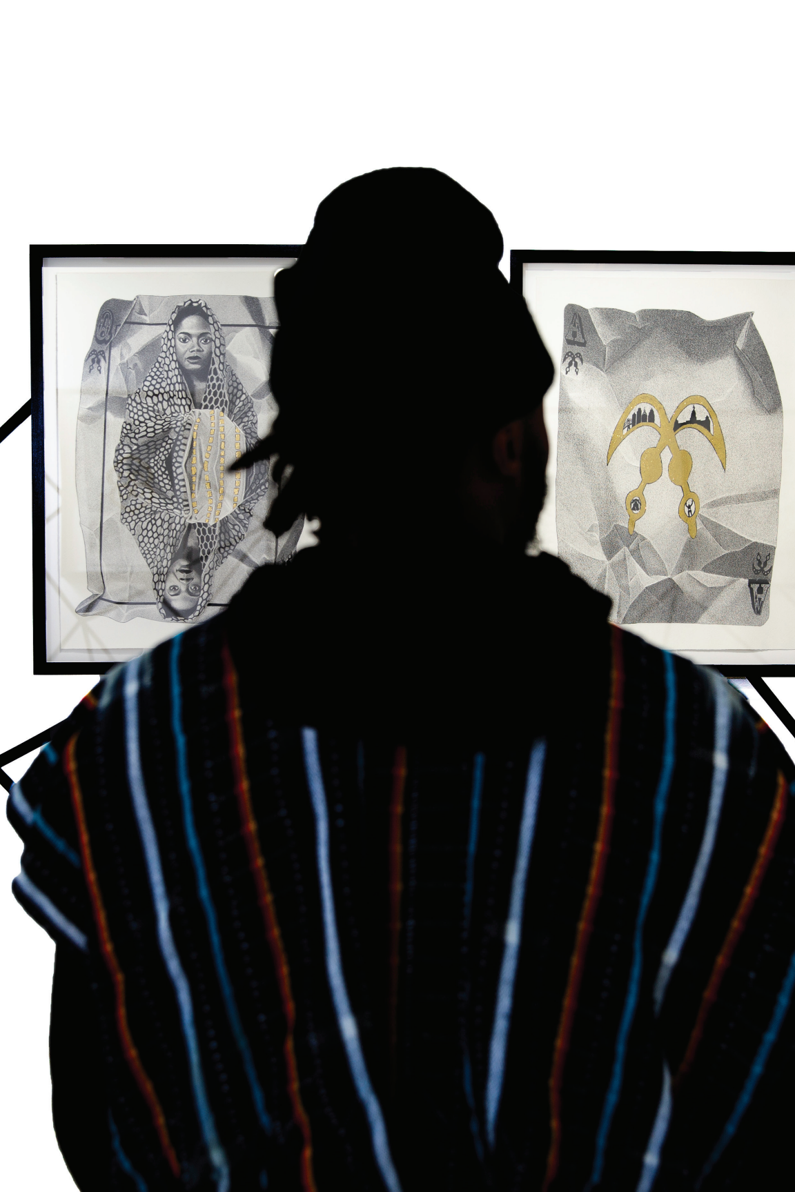
OPPOSITE: Ferguson Amo (MFA 2019), Contingent Identity Cards of The African Diaspora .